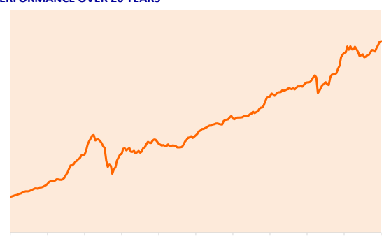
Aug-03 Aug-05 Aug-07 Aug-09 Aug-11 Aug-13 Aug-15 Aug-17 Aug-19 Aug-21 Aug-23